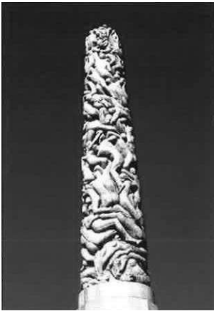
26 A sculpture by Gustav Vigeland: